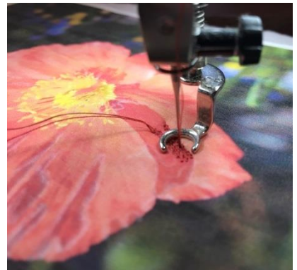
Stitching with #5 Thread