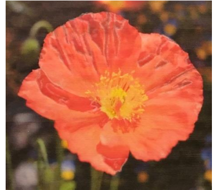
#5 Sections Outlined