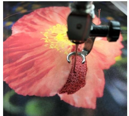
Blending #4 Thread